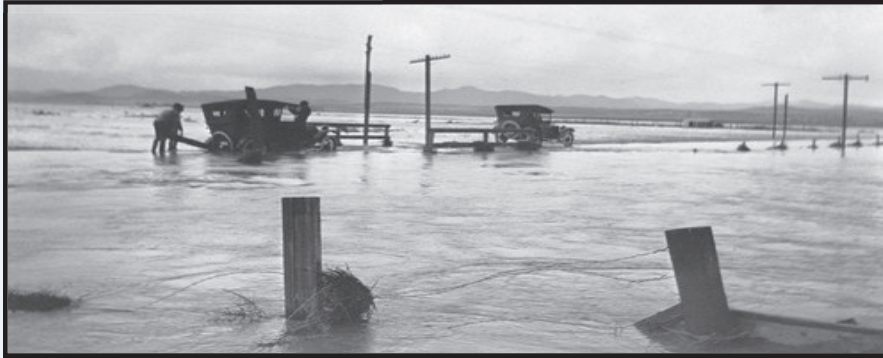
Vehicles found themselves stuck during the Perris Flood of 1927.

The Riverside County Flood Control and Water Conservation District is a special district created by an act of the California State Legislature in 1945.