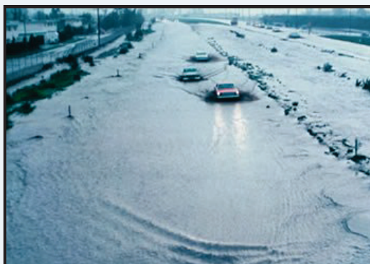
Flooding in 1969 did great damage along Magnolia Avenue in Corona (left) and Highway 91 in Riverside (right).

The District has 235 employees in eight divisions: Planning, Design and Construction, Surveying and Mapping, Operations, Regulatory, Information Technology, Finance and Watershed Protection.