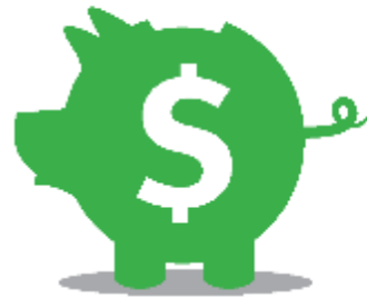
Delta Dental Premier ®